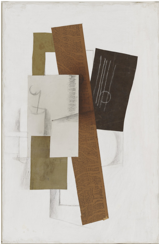
Georges Braque Guitar